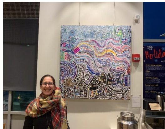
New mosaic piece on rotation at Flour Bakery at 40 Erie Street in Cambridge.